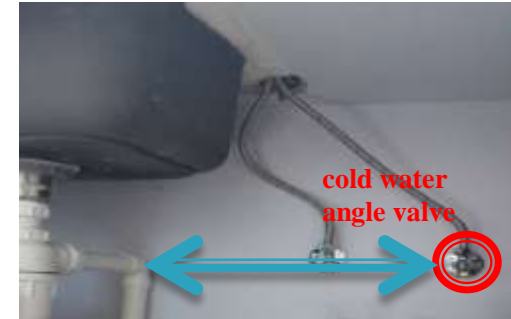
Fig.3 - Photo that can show the conditions of the cold water angle valve and the distance between the angle valve and the fixed settings of its surroundings (like water pipe, gas pipe etc.), to see if they will affect the installation work.

Step 2: Send all the above mentioned photos and the photo of Receipt of buying 3M Water Filters from AAHL authorized retailers, along with your contact details and service address to (852) 9275 8082 via WhatsApp