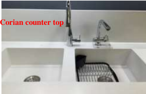
Fig.1- Photo that can show the sink/counter top material clearly.

Step 1: Please use the following fig. 1 – fig.3 as reference to take photos on the planned position/environment for installing the water filter